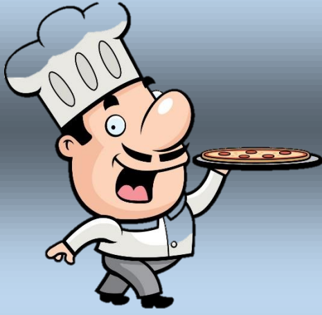
Chef – طاه (tah)