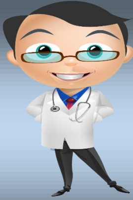
Doctor – طبيب (tabib)