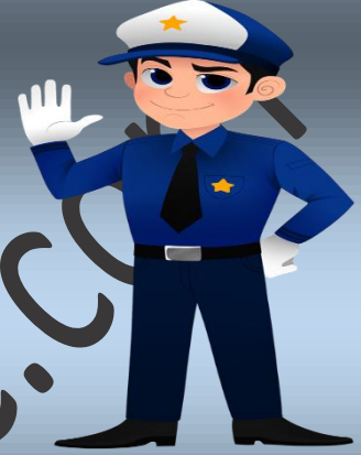
Police – شرطة (shurta)