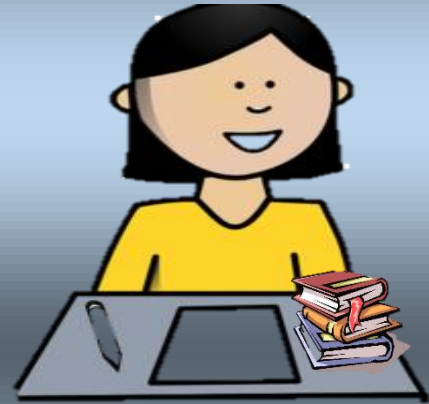
Librarian – أمين المكتبة (amin almaktaba)