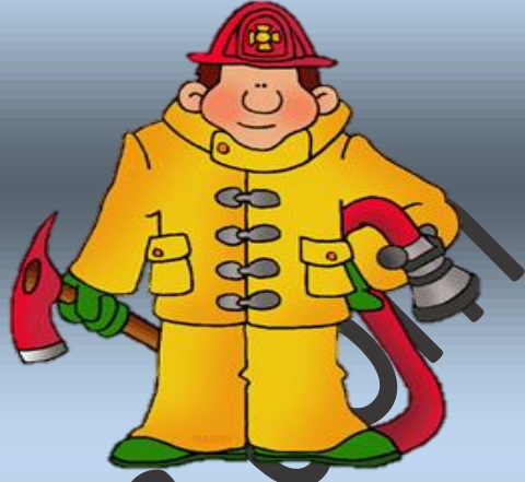
Fireman- رجال الاطفاء (rijal al'iitfa')