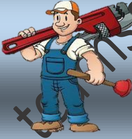
Plumber – سمكري (samkri)