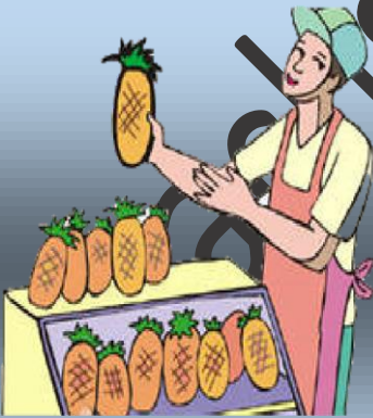
Dealer – تاجر (tajir)